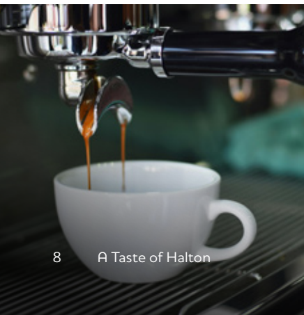
8 A Taste of Halton

For a special treat, book a Heritage Afternoon Tea, served in the glass-walled Observatory Gallery, with stunning views over the surrounding